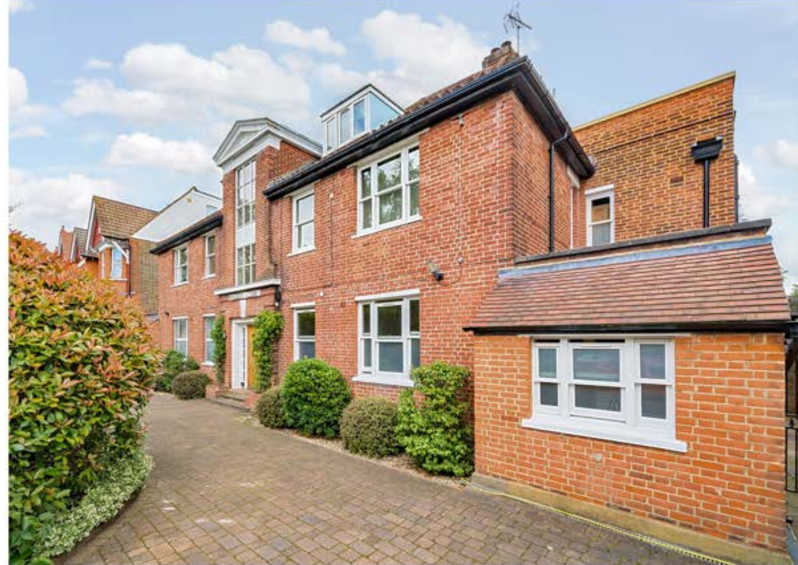
Nicholas Court, West Ealing, W13